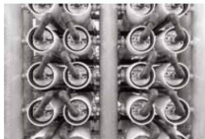
Many desalination plants use membranes to remove salt from seawater.

Desalination use worldwide has increased dramatically over the past 40 years. Brackish and seawater desalination plants operating worldwide in municipal, military and industrial applications produce a combined daily capacity of more than 18 billion gallons (source: 2009-2010 International Desalination Association Yearbook ).